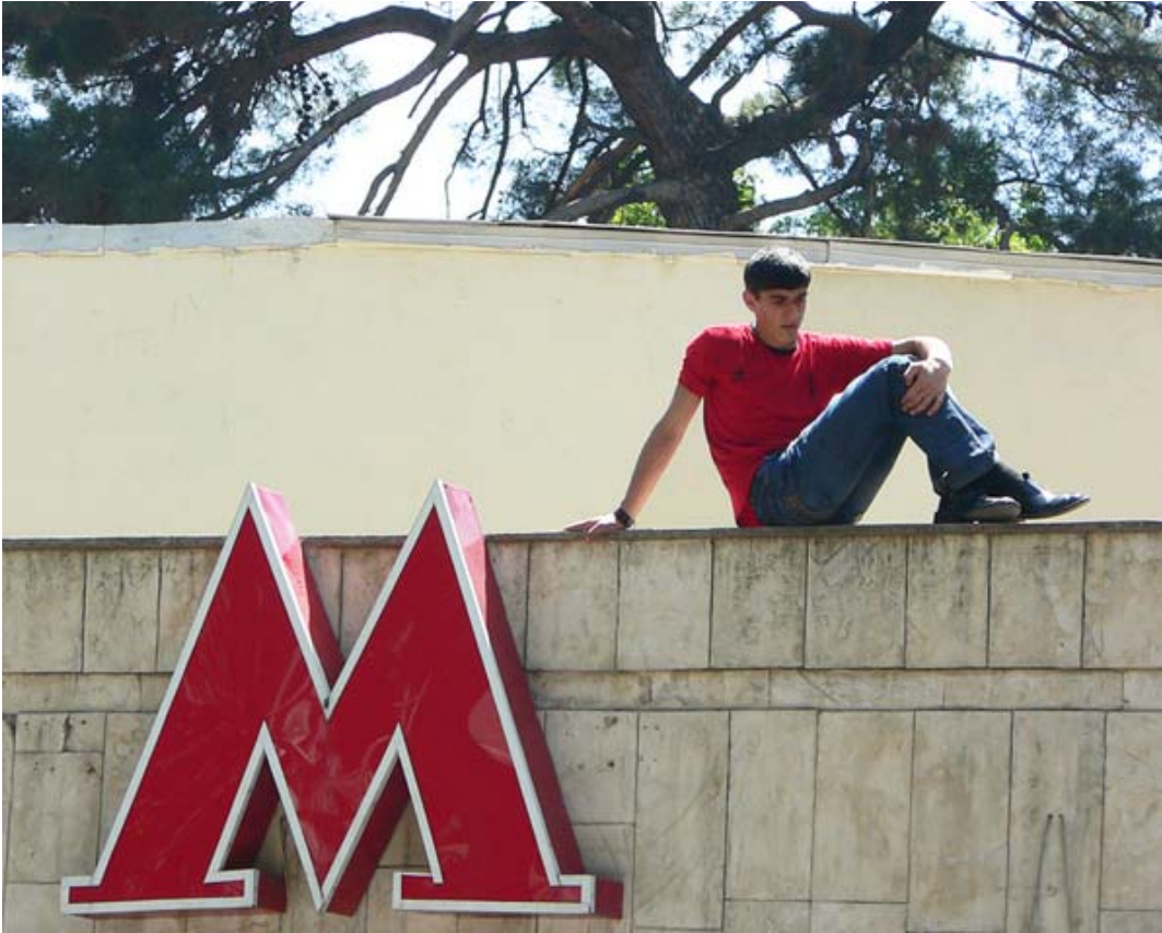
this is how fixed-time husbands' labor exchange could look like