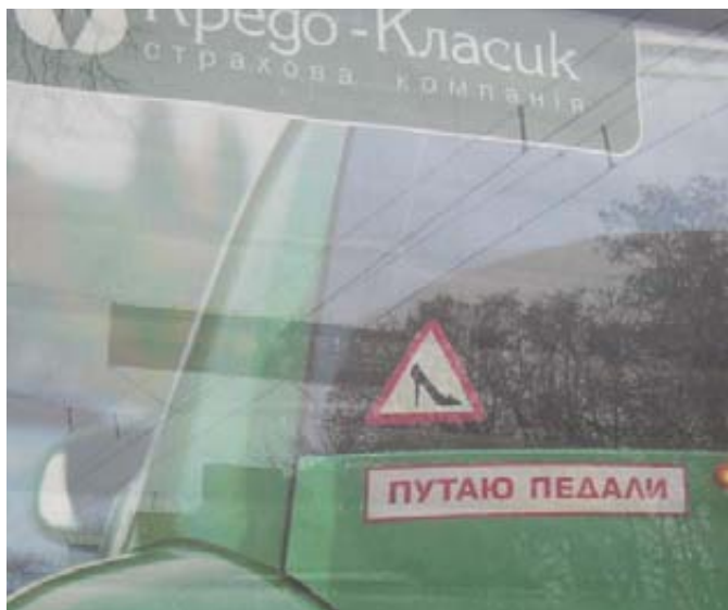
this sexist joke is maybe caused by the competitors' jealousy! A sticker on the car window reads: "I mix up accelerator and break"

Because of the initial success of the new service, part of the drivers separated from the bigger company and started its own business. It is possible that Car Ladies will soon flood the market of Perm and other cities, in the case if the business overcomes growth costs. The new business has several weaknesses: the ladies use their personal cars without considering wear and tear problems. There is no corporate service center organized for the new company. The Ladies' husbands are those who are in charge for fixing cars, which means that unaccounted, honorary, and non-qualified labor is being used. Because of this type of labor the ladies have higher wages. But it is known that the economy does not like imperfections like that. That's why it is time for the ladies to transform their company into a professional business.