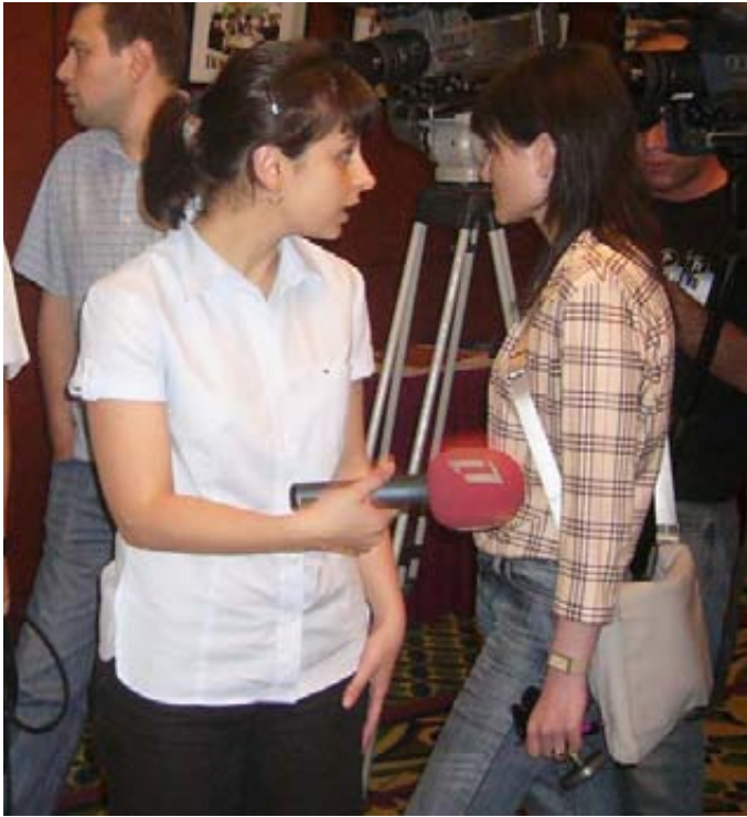
...and finally I said: "You can have this microphone back!"