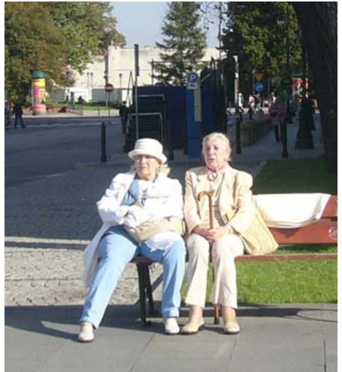
as a result of their 50-years-old marriage, these women could become quite wealthy!

If a housekeeping labor would be paid, American housewives would become wealthier than working women, the research published at Salary.com states. When staying home, a woman who has kids simultaneously becomes a full-day teacher, a driver, who takes kids to their schools, a house manager, a cook, an administrator, a nurse, a psychologist, as well as a mechanic, an electrician, a janitor and a carpenter. This is why, the research reads, an average housewife's salary should make $134 121 per year, which is more than $11 thousand per month. This estimate includes not only hourly pay of each listed professionals, but also incorporates overtime, as a housewife's working schedule is irregular, and she works at home for 91.6 hours per week in an average. At the same time, a housewife's husband works for 45 hours a week only (9-hour working day). This is why a 'regular' weekly payment for women working at home makes $45.7 thousand per year, while their 'overtime' pay should mean additional $88.4 thousand.