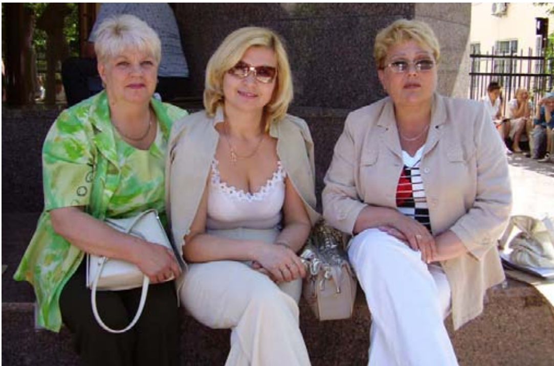
here they are, the founders of the Social Alternative. They have the truth, and they will win. By the way, Amnesty International has already started studying the case.

But the women managed to institute legal proceedings under the money misappropriation charges. However, because of the corruption within the lawenforcement agencies, the criminal case was several times stopped. This year the