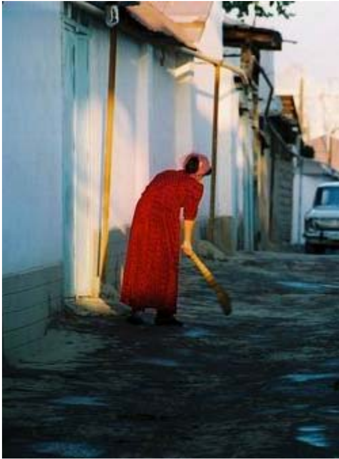
you can earn even a million, but sweeping the yard will be only your duty anyway