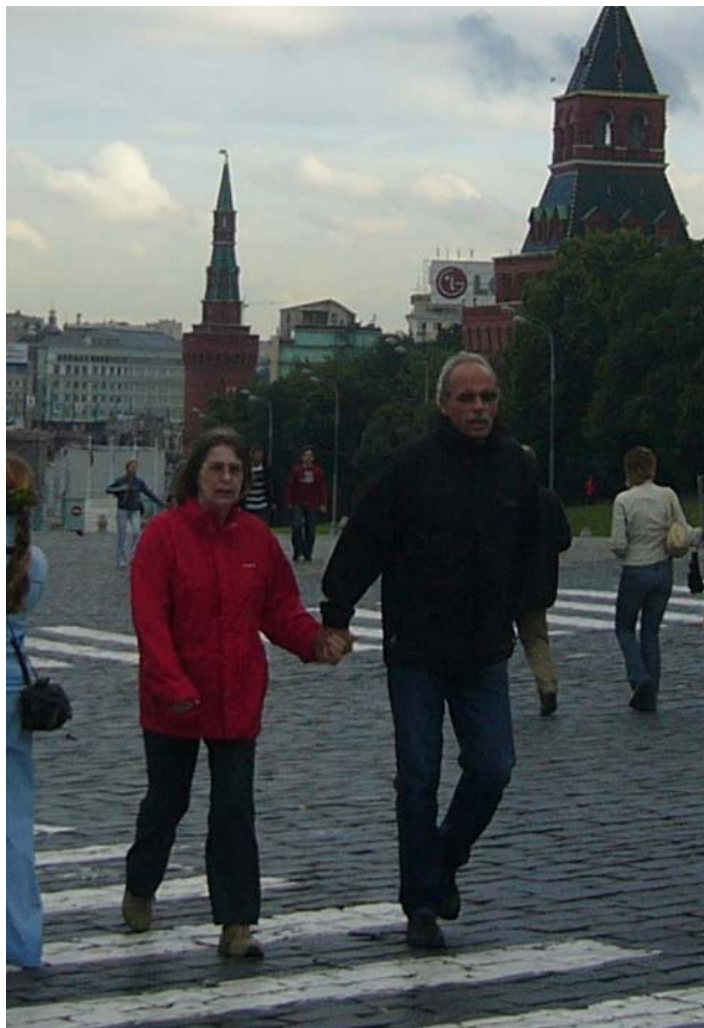
a good husband should remember that he holds the hand of the staff of professionals, who includes: home manager, cook, nurse, babysitter, designer, psychologist, and – sometimes – electrician and mechanic

urgently, when parents need to leave the house will agree to $5 per hour. In any way, a standard contract foresees that pay doubles in the case a babysitter works overtime. But working women see their kids in 'overtime' only. This is why their virtual earning should make at least $10 per hour, which makes some $2000 a month. If you add cooking and housecleaning, women's home duties should cost $3300-3500 a month.